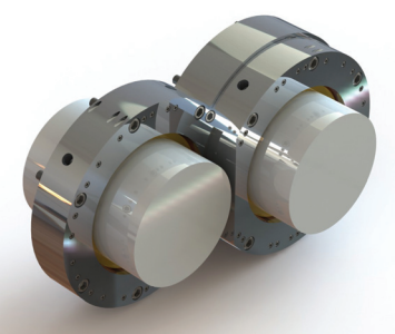
The Inpro/Seal AM Smooth Bore DS (Dual Shaft) is designed specifically for twin shaft extruders with tight clearances between the shafts.

Count on us to improve reliability, increase MTBR, and maximize asset protection and utilization. As the inventor of Air Mizer technology and a global leader in engineered sealing solutions, Inpro/Seal has the knowledge and local sales network to deliver expert engineering and proven results.