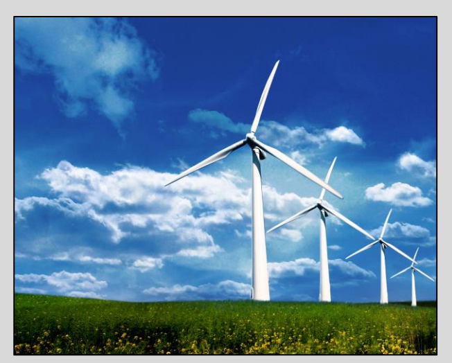
Major Onshore Wind Turbine OEM

These seals have operated successfully in the field since 2012. After initial installation, both the end user and OEM have deployed this solution on numerous turbines across multiple wind farms with no issues.