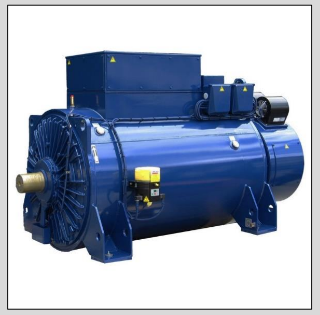
Wind Turbine Generator