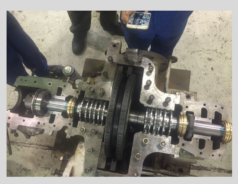
After: Installation of Sentinel Floating Brush Seals and Bearing Isolators