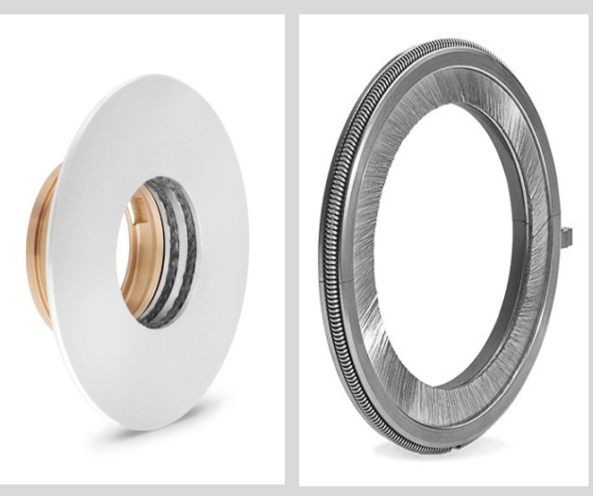
Inpro/Seal Steam Turbine Bearing Isolator & Sentinel Floating Brush Seal (FBS)