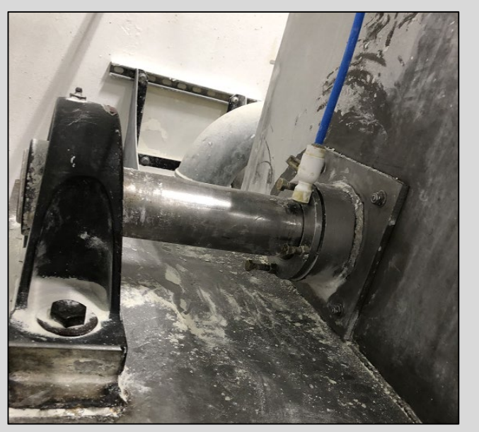
Before: Leaking ribbon blender showing air purged stuffing box.

Since the mixer was upgraded with Air Mizer shaft seals, they have had no issues. The customer is extremely happy with the change.