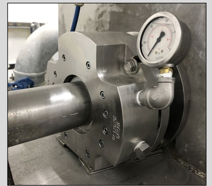
After: Food Grade Air Mizer installation